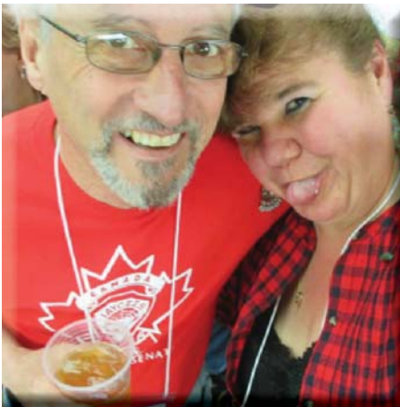
Canadian Senator Vik with Kim Hubbell #68729