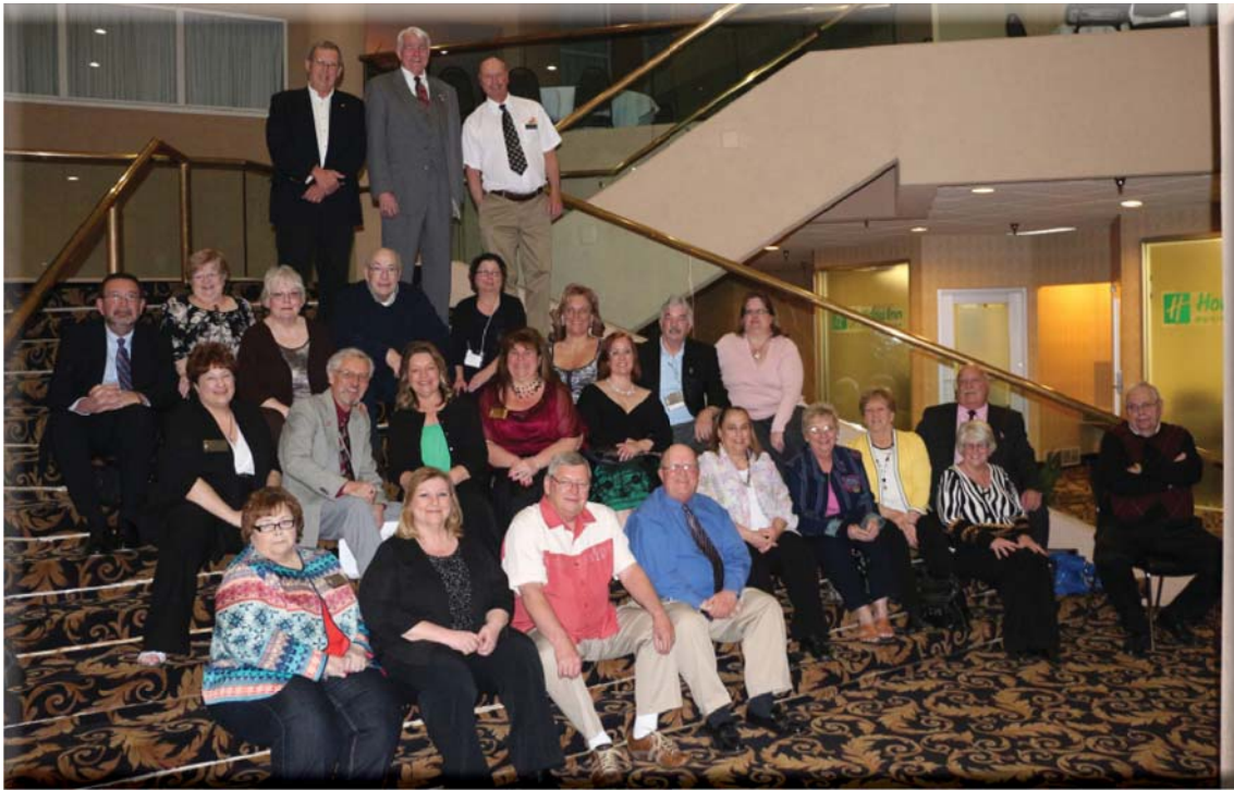
A great group of Michigan JCI Senators in Louisville KY