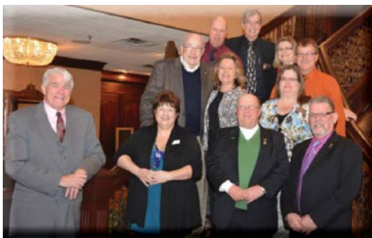
Presidents of the Michigan JCI Senate